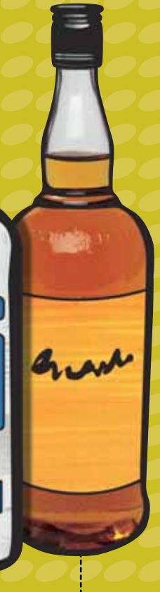
1125ML BOTTLE OF SPIRITS @ 45% ALCOHOL =