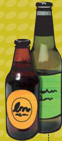
330ML BOTTLE OF BEER @ 5% ALCOHOL =