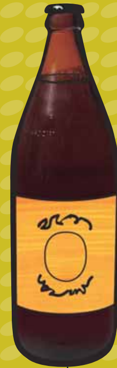
750ML BOTTLE OF BEER @ 4% ALCOHOL =