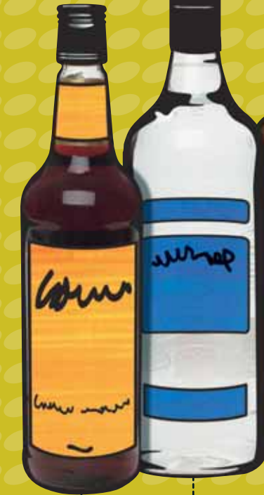
700ML BOTTLE OF SPIRITS @ 40% ALCOHOL =