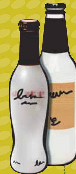
275ML BOTTLE OF RTD (READY TO DRINK) SPIRITS @ 5% ALCOHOL =