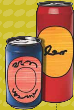
330ML CAN OF BEER @ 4% ALCOHOL =

This is only a guide. Always check the label to be sure of how many standard drinks you are drinking.