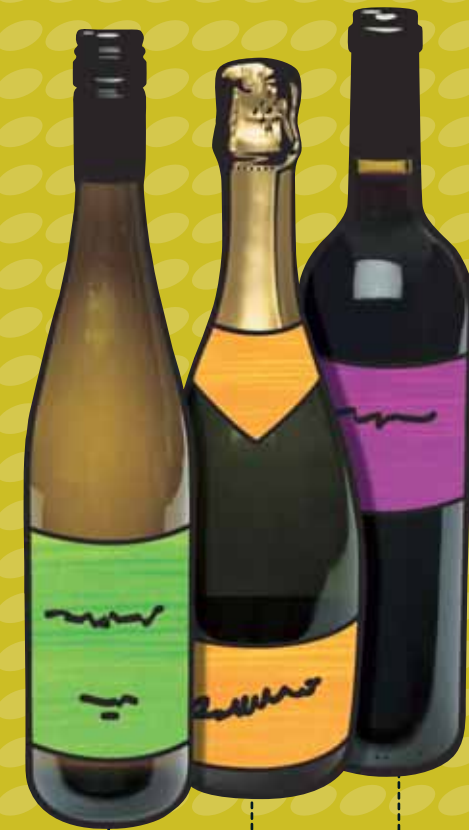
750ML BOTTLE OF SPARKLING WINE @ 12% ALCOHOL =