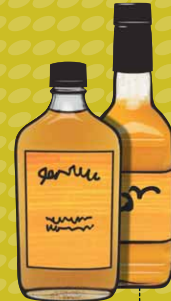
375ML BOTTLE OF SPIRITS @ 37.5% ALCOHOL =